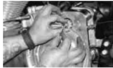
Fig. 9 Install starter pinion, supplied with kit. There are 2 bolts supplied, one for 1990-93 and one for 1994-up.

11. Grease starter shaft and install our starter pinion gear onto starter shaft, apply red loctite to starter bolt and tighten to HD specifications. (We supply 2 starter bolts with the kit, one is a 1/4-20 x 2-1/2" for 1990-93 starters the other is a 10-32 x 2-1/2" for 1994 and up starters. Be sure not to tighten starter bolt too tight as this may interfere with proper engagement of the starter pinion gear.) (Fig. 9)