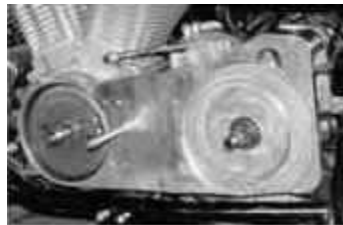
Fig. 5 Install motor plate and check for proper fit

6. Install motor plate in place on stock inner primary. Refer to alignment procedure. (Fig. 5)