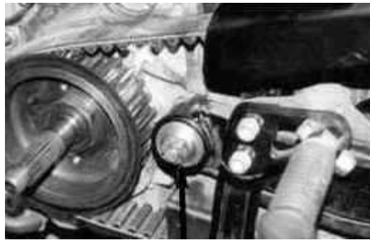
Fig. 2 Remove castle nut on drive side to allow pivot bolt to be removed

3. Remove castle nut on pivot bolt to allow pivot bolt to be removed. (Fig. 2)