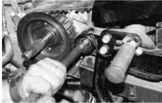
Fig. 3 Push shaft through by using a blunt drift, so that the swing arm stays intact

4. Push pivot shaft through by using a blunt drift, as you follow the shaft through with drift, swing arm will stay in place. (Fig. 3)