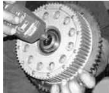
Fig. 8 Use loctite on spline hubs to ensure proper fit on mainshaft.

9a. For spline mainshaft models, 1990-up, apply red loctite into the back side of our hub inside of the spline and let the loctite flow onto the mainshaft when sliding on the rear basket assembly. This procedure is necessary so that the hub and mainshaft will fit together properly and will not let the mainshaft spin inside of our hub. (Fig. 8)