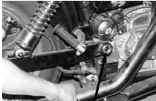
Fig.1 Remove exhaust to allow access to the swing arm pivot bolt

2. Remove exhaust to allow access to the swing arm pivot bolt. (Fig.1)