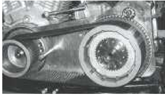
Fig. 6 Install belt drive, both pulleys and belt at the same time.

Apply loctite and install and tighten to HD specifications, mainshaft hub nut. We supply a special hub nut with seal for all spline shaft models 1990 and later.