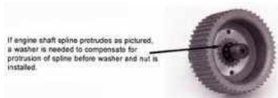
Fig. 7 When using any of the BDL inserts with special nut, please note that the nut is counter-bored to cover the splines should they protrude. COVERING THE SPLINE IS VERY IMPORTANT

Engine shaft spline should not protrude from pulley. Be sure to red loctite front engine nut and torque to HD specifications. (Electric impact is preferred). (Fig. 7)