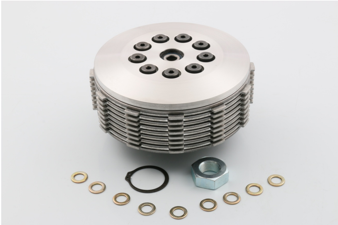
Top picture CC-122H-CSPP, Competitor Clutch Complete. Fits 2011-2016 Big Twins. W/ HYD Clutch

Refer to the OEM Service Manual for how to R&R your stock clutch, clutch basket and clutch hub, Our CC-122-CSPP Competitor clutch hub with press into basket just as a stock one does.