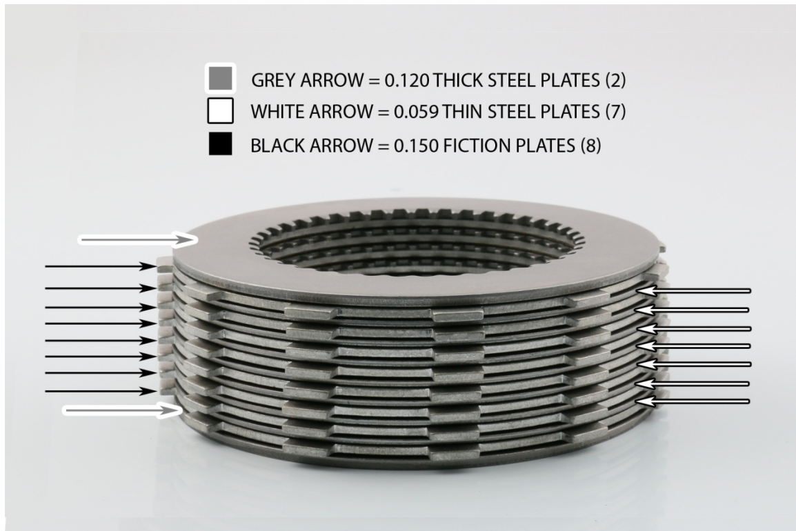
Above Picture: CC-122-CPS Clutch Plate Set, = (2) CC-130 BP Backing Plate, @ (.120") EA., (8) CC-130-CP, Friction Plates, @ (.150") EA. And (7) CC-130-CS, Thin Steel Drive Plates, @ (.059") EA. There is a Total of (17) total clutch plates. Clutch Stack Height, = 1.880" - 1.895"

Both styles of these clutch plates have a rounded side and a flat side load all (17) clutch plates into basket so the rounded side faces you.