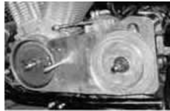
Fig. 1 Install motor plate and check for proper fit