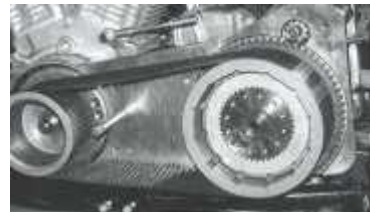
Fig. 2 Install belt drive, both pulleys and belt at the same time

Install and tighten to HD specifications, mainshaft hub nut. We supply a special hub nut with seal for all spline shaft models 1990 and later. (Fig. 3)