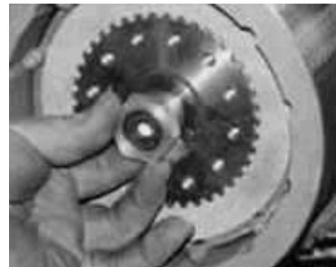
Fig. 3 Tighten sealed mainshaft nut, supplied with 1990-up kits only. 1986-89 models must use stock hub nut and seal kit supplied.

Install and tighten to HD specifications, mainshaft hub nut. We supply a special hub nut with seal for all spline shaft models 1990 and later. (Fig. 3)