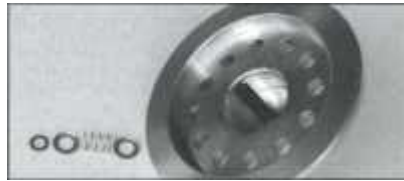
Fig. 5 Pictured here is the seal kit installation which is supplied with all 1986-89 belt drives only. A sealed hub nut is supplied with all kits 1990- up. A stock HD hub nut with seal must be used with all 1983 and earlier kits.

5a. For spline mainshaft models, 1990-up, apply red Loctite® into the back side of our hub inside of the spline and let the Loctite® flow onto the mainshaft when sliding the rear basket assembly on. This procedure is necessary so that the hub and mainshaft will fit together properly and will not let the mainshaft spin inside of our hub. (This procedure is not necessary on taper shaft models 1986-89). (Fig. 6)