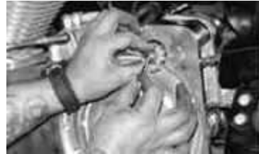
Fig. 7 Install starter pinion, supplied with kit. There are 2 bolts supplied, one for 1990-93 and one for 1994-up

(We supply 2 starter bolts with the kit, one is a 1/4-20 x 2-1/2" for 1990-93 starters the other is a 10-32 x 2-1/2" for 1994 and up starters. Be sure not to tighten starter bolt too tight as this may interfere with proper engagement of the starter pinion gear.) (Fig. 7)